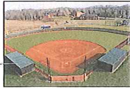
PROPOSED SOFTBALL FIELD WITH DUGOUTS