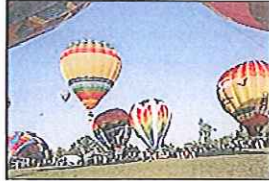
HOT AIR BALLOON FESTIVAL