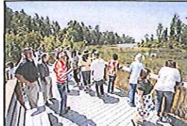
PROPOSED WETLANDS OVERLOOK