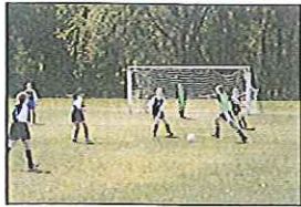
PROPOSED SOCCER FIELD