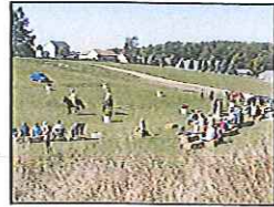
HORSES AND HOUNDS EVENT